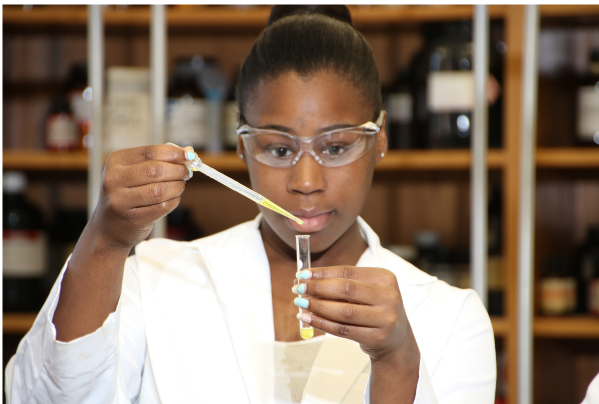
The Rust College Science Lab